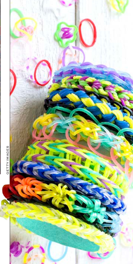
ALL THE RAGE The brightly colored bracelets can be created in a range of designs and styles.

Ask a parent if he or she recalls a hot toy from childhood. Why was it so popular? How long did the trend last? Search online to see if the toy is still available. If so, what does it cost now?